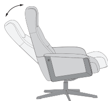
EFFORTLESS RECLINING MECHANISM