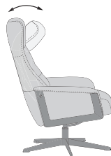
FRICTION BASED HEAD-AND NECK SUPPORT